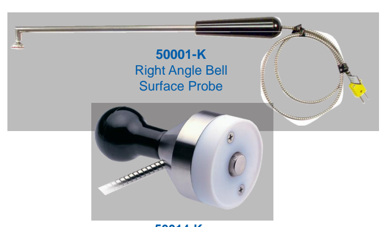
50014-K Weighted Griddle Surface Probe