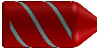
MCSS / HCSS Single Spiral

Coated foam pigs are constructed of polyurethane foam with a durable polyurethane elastomer coating that is applied in a variety of patterns, with criss-cross being the most common.