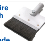
8" Sponge Electrode