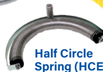
Half Circle Spring (HCE)