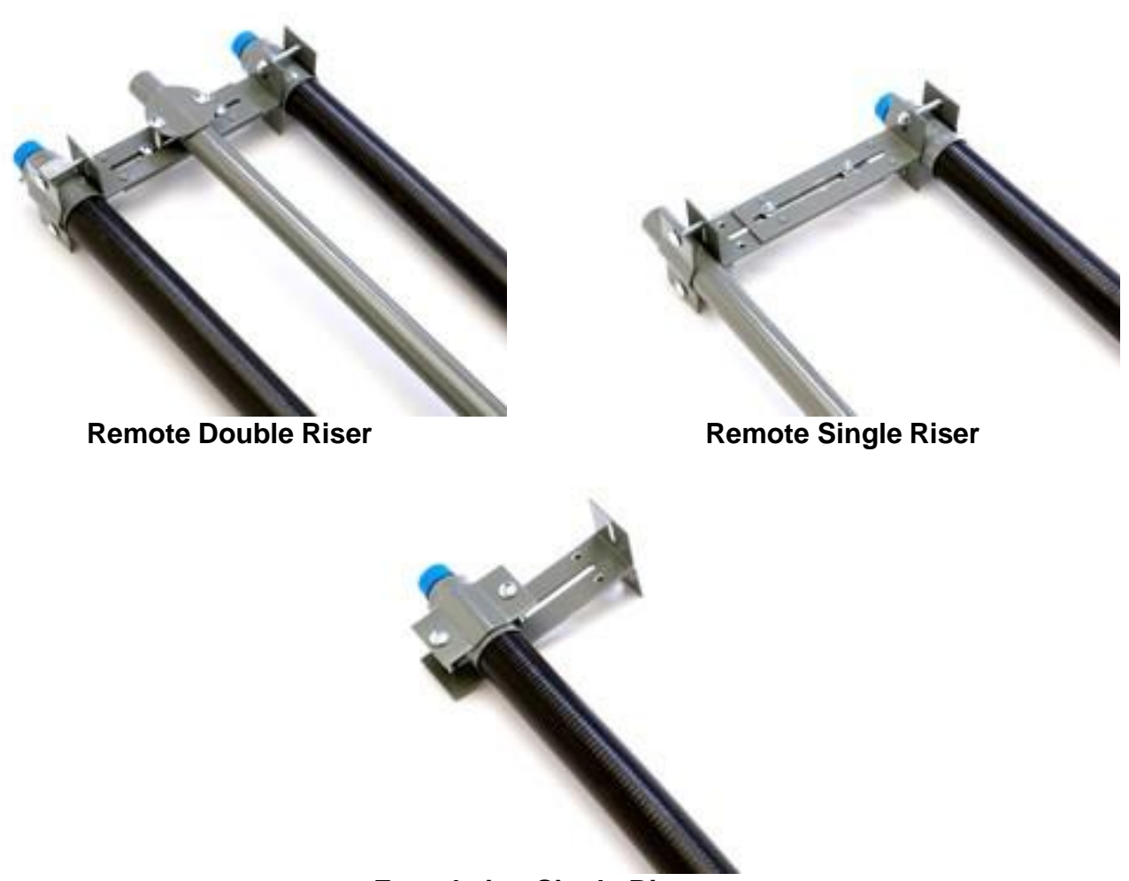
Foundation Single Riser

When a structure is not available or when foundation systems cannot be used, look to ECSI for a variety of remote assemblies that provide safe and secure mounting of gas meters and gas risers.