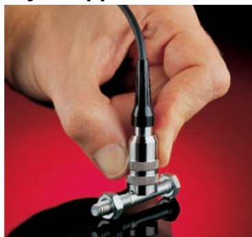
...and for measuring galvanizing, plating, anodizing, and more.