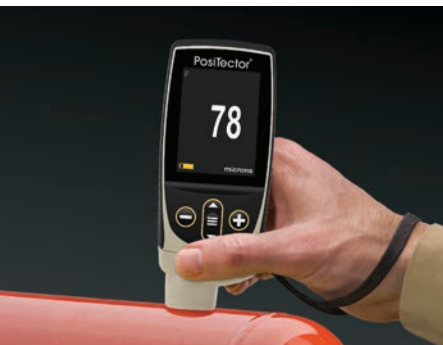
For measuring paint, powder, etc. on all metals...