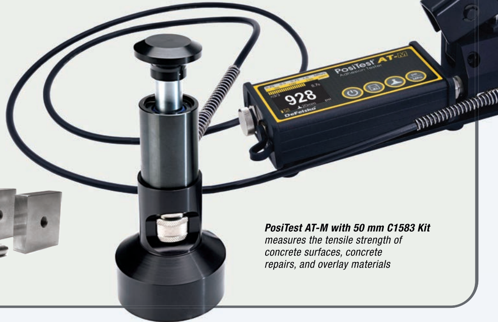
PosiTest AT-M with 50 mm C1583 Kit measures the tensile strength of concrete surfaces, concrete repairs, and overlay materials