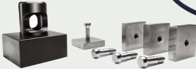
PosiTest AT 50T KIT measures the tensile strength of ceramic tile adhesives.