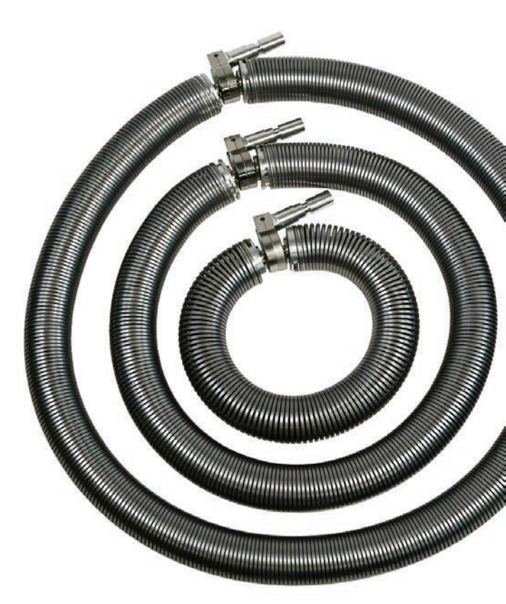
Rolling Spring Electrodes