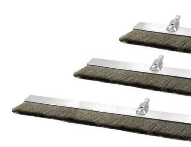
Flat Wire Brush Electrodes