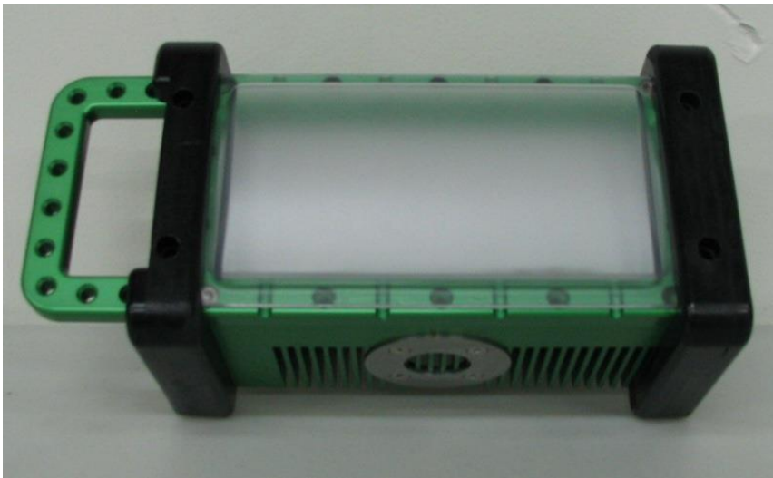
Brick with #10 Filter and Roll Top installed.