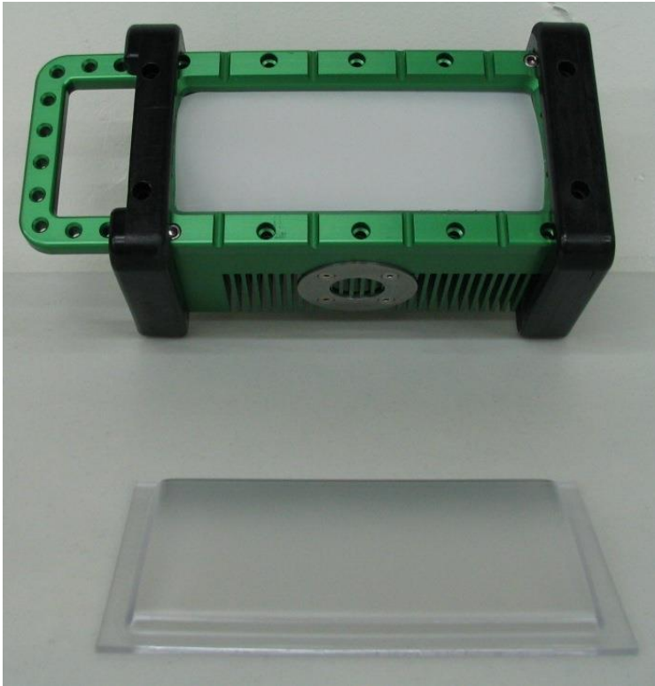
Brick with # 10 Filter installed.