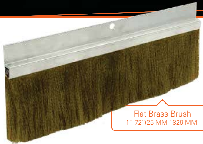
Flat Brass Brush 1"- 72"(25 MM-1829 MM)