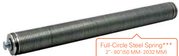
Full-Circle Steel Spring*** 2"- 80"(50 MM- 2032 MM)