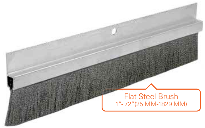
Flat Steel Brush 1"- 72"(25 MM-1829 MM)