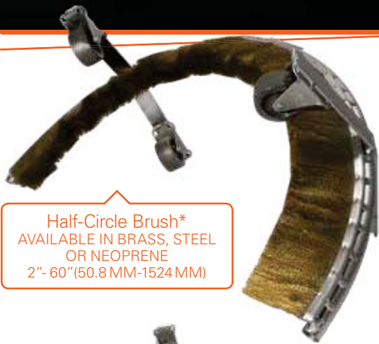
Half-Circle Brush* AVAILABLE IN BRASS, STEEL OR NEOPRENE 2"- 60"(50.8 MM-1524 MM)

FOR BRUSH & OTHER TYPE ELECTRODES the connection is a simple wing nut.