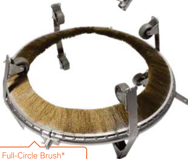
Full-Circle Brush* AVAILABLE IN BRASS, STEEL OR NEOPRENE 2"- 60"(50.8 MM-1524 MM)