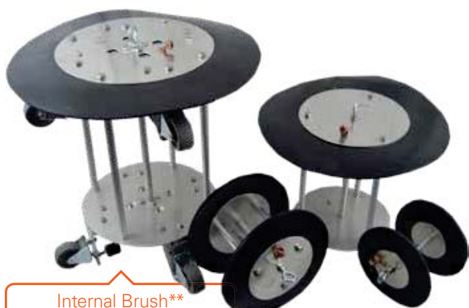
Internal Brush** AVAILABLE IN NEOPRENE 2"-60" (50.8 MM-1524 MM)