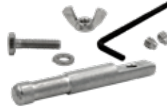
BRUSH ADAPTER KIT ITEM #11934