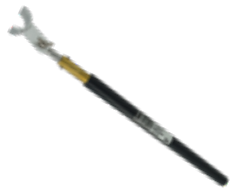
SPRING SUPPORT / PUSHER WAND (18"–72") ITEM #11935