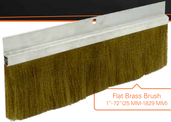
Flat Brass Brush 1"- 72"(25 MM-1829 MM)