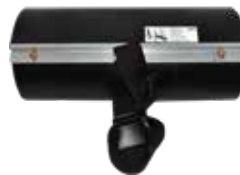
GROUNDING COLLAR (FOR USE WITH 790 ONLY) ITEMS: 14188 (4"–8"), 14189 (10"–18"), 14190 (20"–30"), 14191 (32"–42"), 14192 (48"–60")