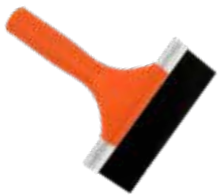
DC PADDLE ITEM #11994