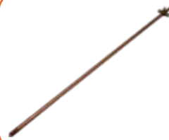
GROUNDING ROD ITEM #14196