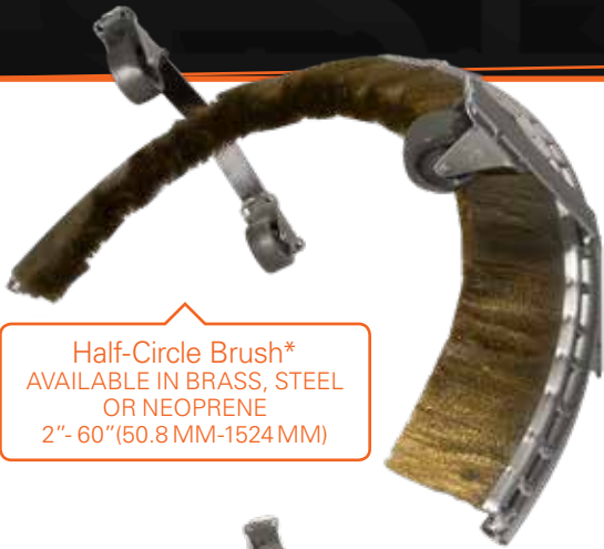
Half-Circle Brush* AVAILABLE IN BRASS, STEEL OR NEOPRENE 2"- 60"(50.8 MM-1524 MM)

FOR BRUSH & OTHER TYPE ELECTRODES the connection is a simple wing nut.