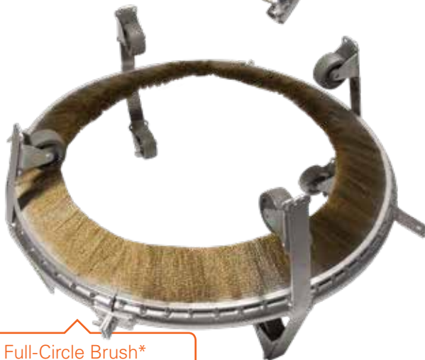
Full-Circle Brush* AVAILABLE IN BRASS, STEEL OR NEOPRENE 2"- 60"(50.8 MM-1524 MM)