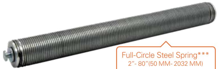
Full-Circle Steel Spring*** 2"- 80"(50 MM- 2032 MM)

Custom size electrodes are always available. Contact our sales staff to discuss your specific electrode needs.