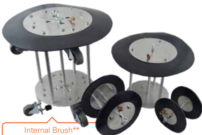
Internal Brush** AVAILABLE IN NEOPRENE 2"-60" (50.8 MM-1524 MM)