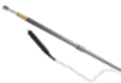
FLEX-WAND (36"–72") ITEM #13203