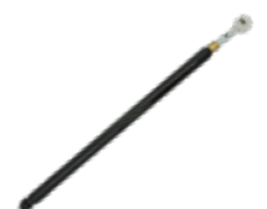
SPRING/BRUSH WAND ELECTRODE (36"–72") ITEM #11932