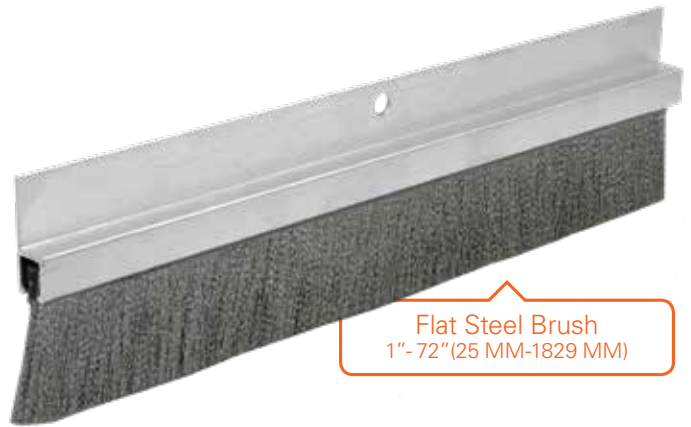
Flat Steel Brush 1"- 72"(25 MM-1829 MM)