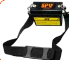
SHOULDER MOUNT BATTERY ADAPTER ITEM #14262