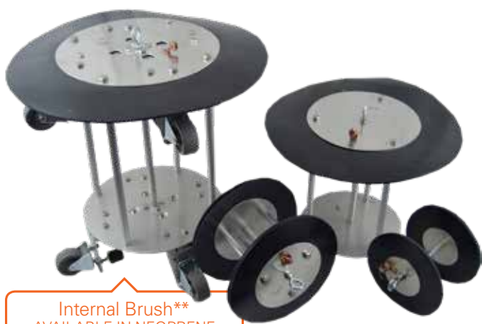
Internal Brush** AVAILABLE IN NEOPRENE 2"-60" (50.8 MM-1524 MM)