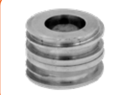
SPRING SPLICER ITEM 13572