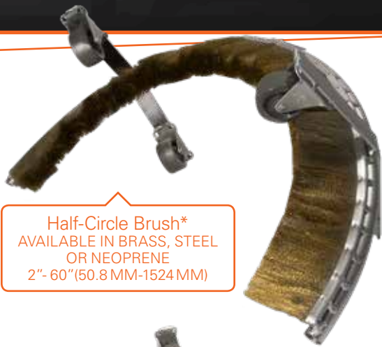
Half-Circle Brush* AVAILABLE IN BRASS, STEEL OR NEOPRENE 2"- 60"(50.8 MM-1524 MM)

FOR BRUSH & OTHER TYPE ELECTRODES the connection is a simple wing nut.