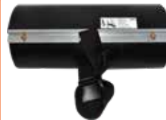
GROUNDING COLLAR (FOR USE WITH 790 ONLY) ITEMS: 14188 (4" - 8"), 14189 (10" - 18"), 14190 (20" - 30"), 14191 (32" - 42"), 14192 (48" - 60")