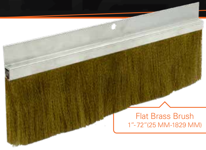
Flat Brass Brush 1"- 72"(25 MM-1829 MM)