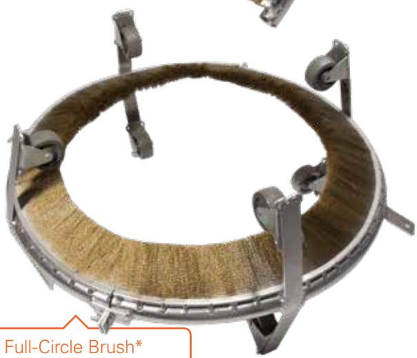
Full-Circle Brush* AVAILABLE IN BRASS, STEEL OR NEOPRENE 2"- 60"(50.8 MM-1524 MM)