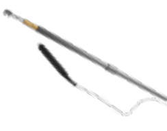
FLEX-WAND (36"–72") ITEM #13203