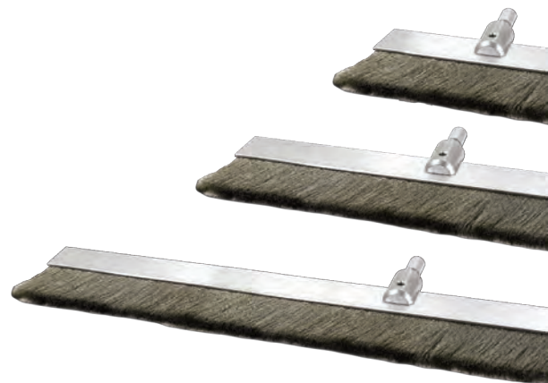
Flat Wire Brush Electrodes

Use spring and brush electrodes made by other manufacturers with DeFelsko adaptors: