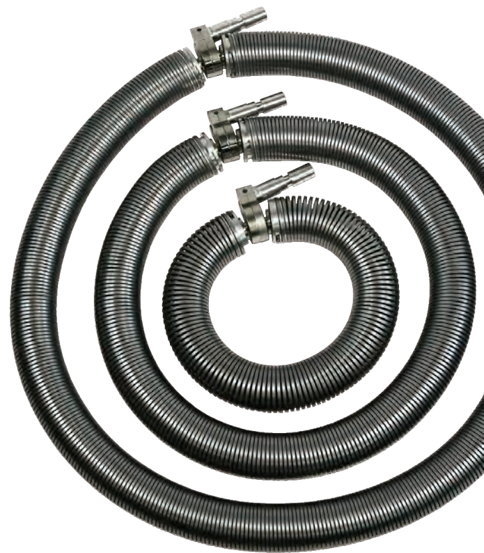
Rolling Spring Electrodes