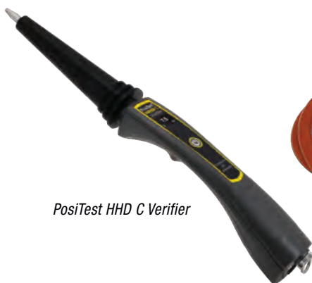
PosiTest HHD C Verifier