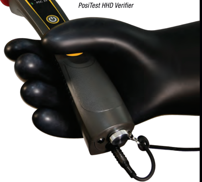
PosiTest HHD Verifier