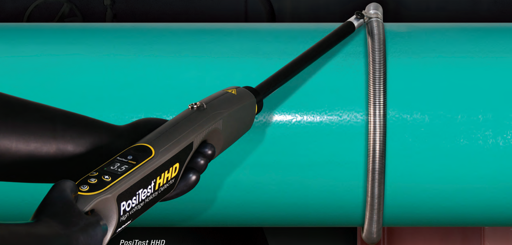
PosiTest HHD shown with optional spring electrode

Detect holidays, porosity, pinholes, leaks, and other discontinuities