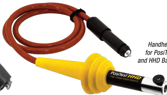
Handheld Wand for PosiTest HHD and HHD Basic only